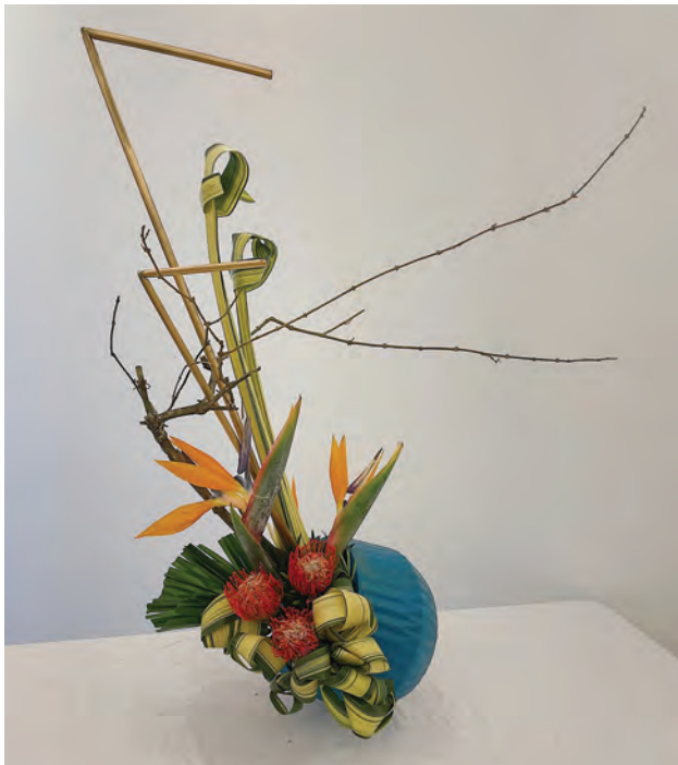
Tan Bean Yee Malaysia