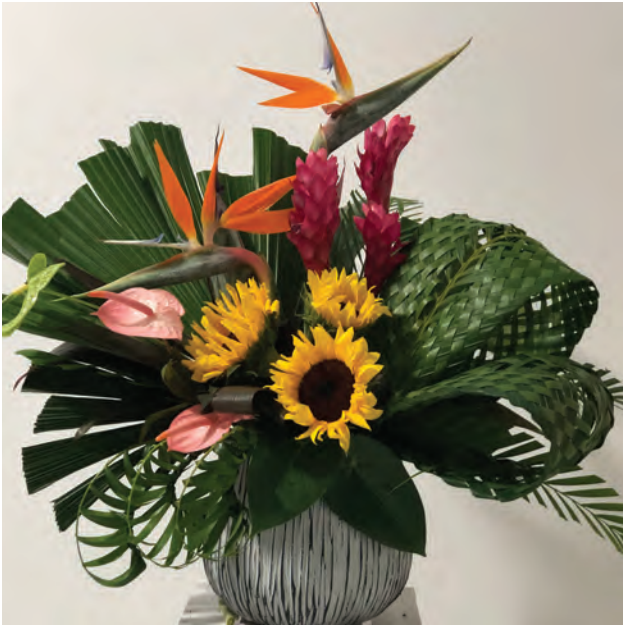
Chan Soke Mei Malaysia