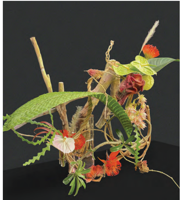
Eunice Teo Khee Choo AIFD Malaysia