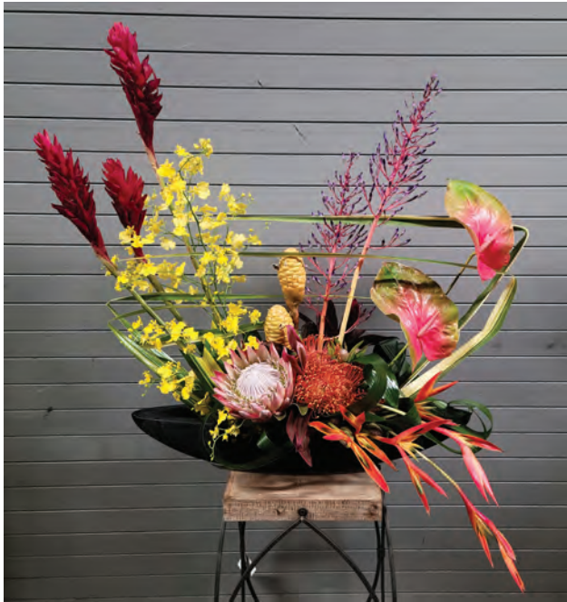
Anna Star Mesa, Arizona

The Jury reviewed design images from 64 contestants and qualified based on quality of image, an overview of the design and the interpretation of theme. The panel of Judges evaluated the 54 qualified designs to a scale of points based on the elements and principles of design and interpretation of the theme. These entries are shown in no particular order.