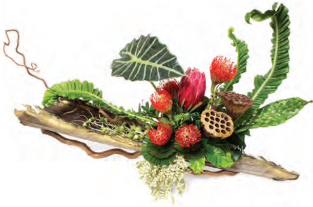
Cheah Foo Choong Malaysia