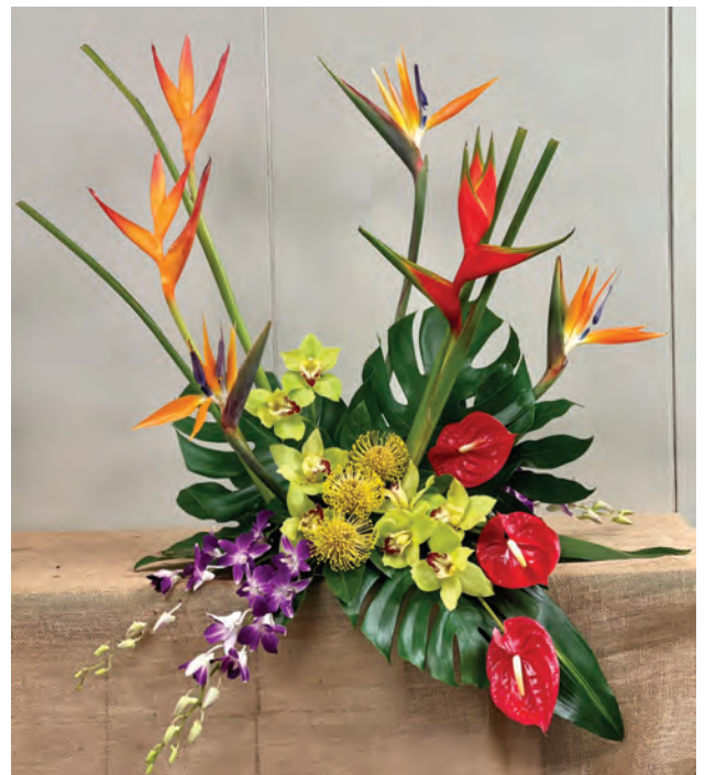
Renée Potter AIFD Tempe, Arizona